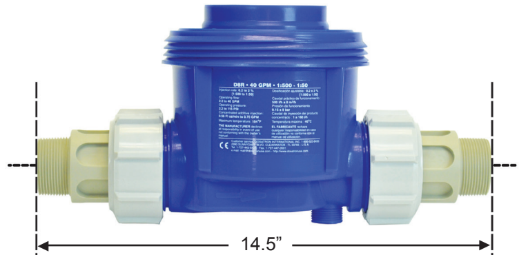
40 GPM - D8R