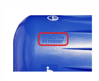
D14 & D8/D40