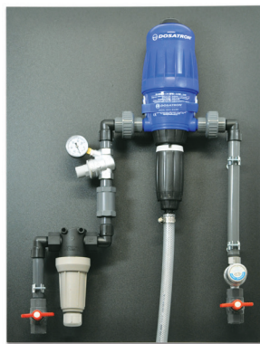
Coolant Mixing System