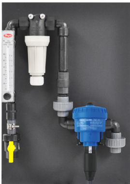
Vibratory Compound System