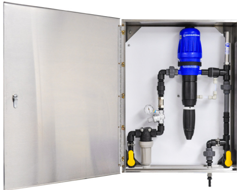
Stamping Compound System

Call 1-800-523-8499 to order your pre-plumbed panels and locking cabinets.