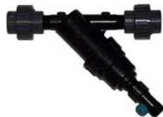
3/4" Filter Part#: AKF5AP11KIT

A 200 mesh /80 micron filter should be installed in front of your DI11. Filter Kit comes complete with 3/4" hook ups.