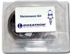
DI11 Maintenance Kit Part#: MKDI11

Maintenance is important and can prolong the use of your Dosatron! In addition to the enclosed seal kit, a complete Maintenance Kit is available.