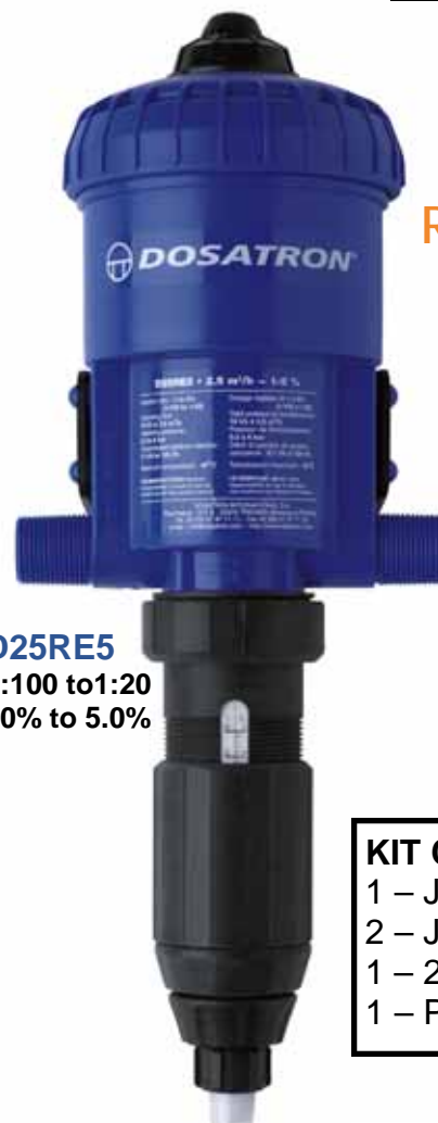
D25RE5 1:100 to 1:20 1.0% to 5.0%

Part #: PJ119 (Replacement for Part #: ED255)