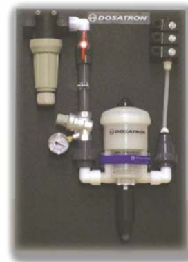
D25RE2 PVDF Self Service Panel