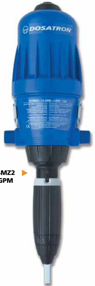
D14M22 14 GPM